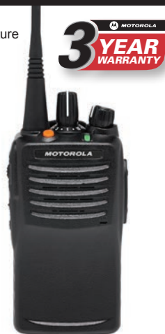
ISVX451 4.3"h x 2.3"w x 1.7"d, 12.6 oz; Black