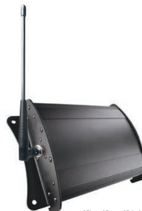
2"h x 8"w x 6"d, 3.5 lbs, Black

FCC license required to operate repeater. FCC license valid for 10 years and renewable. We will process the complicated FCC application, relieving you of this burdensome paperwork. License cost quoted at time of request. Upon FCC approval of frequencies, the repeater is factory programmed and shipped.