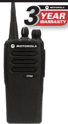
CP200d 5.0"h x 2.4"w x 1.8"d, 12.2 oz; Black