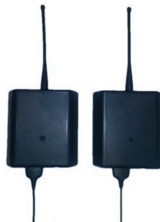
Each unit is 5.5"h x 5.3"w x 1.8"d, 1.0 lb, Black

No license required in U.S., Canada, Mexico